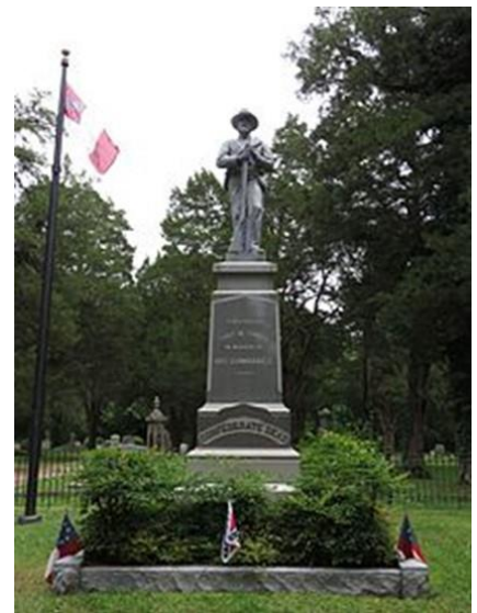
Confederate Monument at Cedar Hill Cemetery, Suffolk, VA

They used FindAGrave to determine the name of the Veteran as it appears on the gravestone and accessed Fold3 and the National Park Service Soldiers and Sailors database to confirm the name of the veteran as it appears in the Military service record that the form required. The forms were sent weekly to the VA Division Graves Chairman who forwarded them to UDC General. Copies were also made for chapter records. A worthy project!