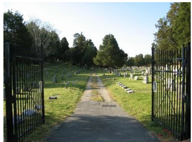
Entrance gates to Cedar Hill Cemetery