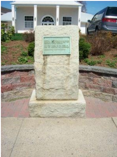
Peyton Anderson Marker